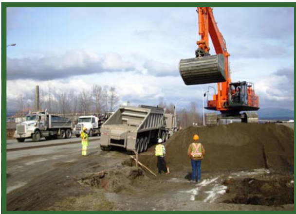
Construction underway at Tannery Road and South Fraser Way

Work began last September and encompasses the section between Fraser Surrey Docks and SFPR east of the Port Mann Bridge.